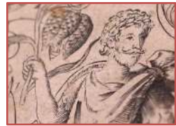
Edward de Vere http://bit.ly/Sigilpart1