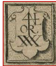
Sigil on pedestal http://bit.ly/Sigilpart2